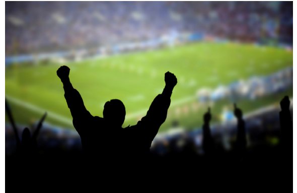
The major security risk at any large sporting event is people

The major security risk at any large sporting event is people. They not only attract fans, but also criminals, traffic chaos and potential terrorist attacks. CCTV surveillance is therefore a key component of the integrated security solution at these events.