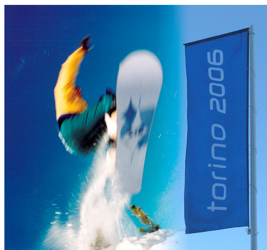
The 2006 Winter Olympics in Turin, Italy deployed a 500-camera distributed IP video system for its surveillance