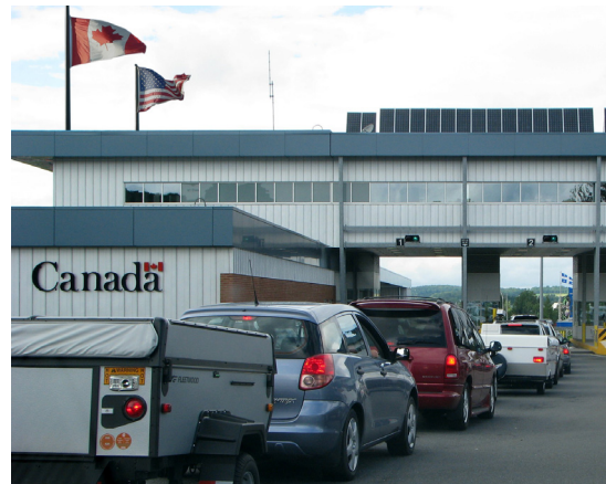
CBSA has installed 500 HD IP cameras to monitor their customs operation on its US-Canadian border crossings and at Vancouver Airport.

The analytics were processed in real time at the edge of the network in the IP transmitter modules that were connected to the analogue cameras. When the analytics function triggered an alarm the Security Management Software automatically alerted the operator and displayed the appropriate camera feed on a spot monitor.